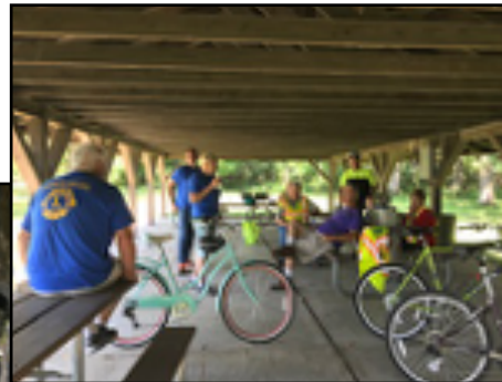
ABOVE: 12 mile break at shelter in Daly Park.