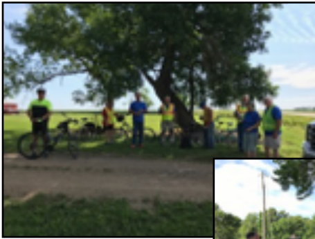
ABOVE: Water stop at Healy Farm. RIGHT: Audrey and family came out to visit with the group.